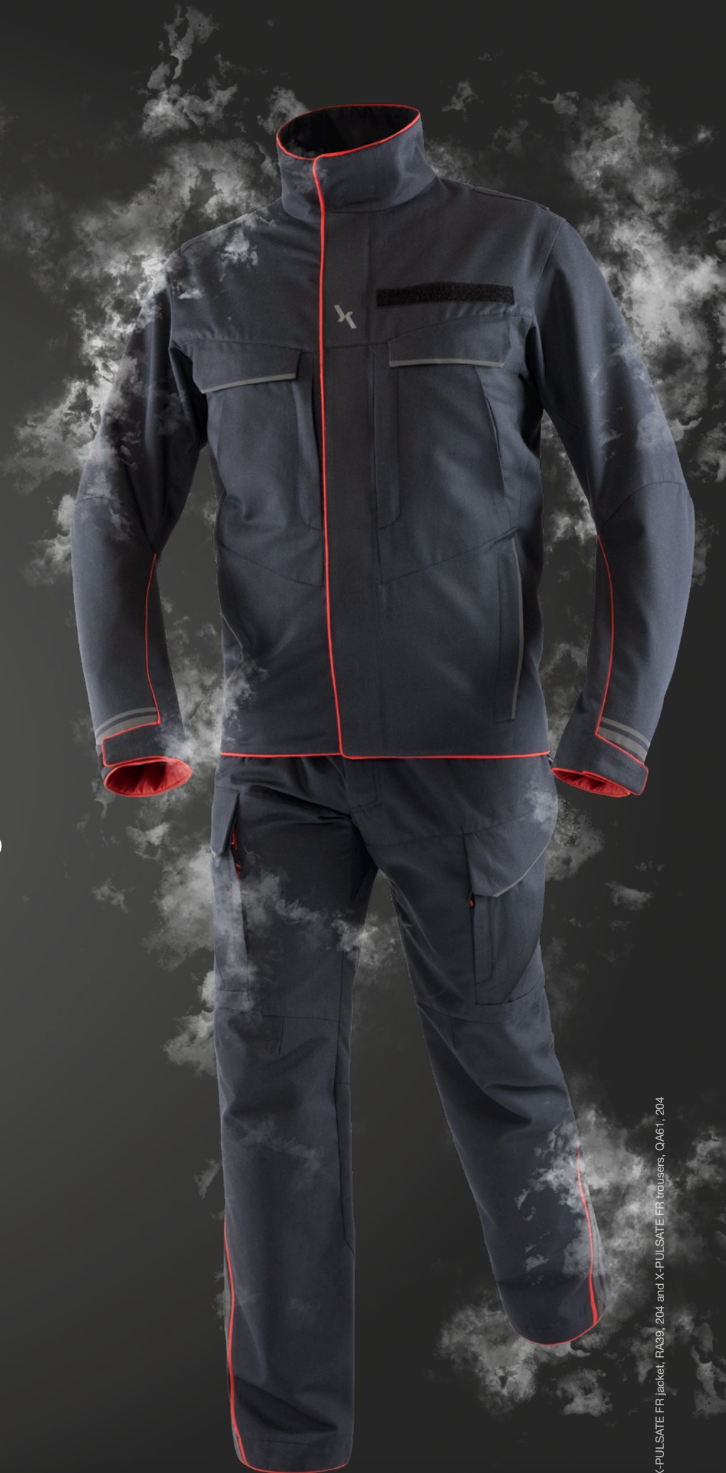
Fig. X-PULSATE FR | jacket, RA39, 204 and X-PULSATE FR | trousers, QA61, 204

AND IN SINGLE COLOR VARIANT (WITHOUT RED COLOR ACCENTS)