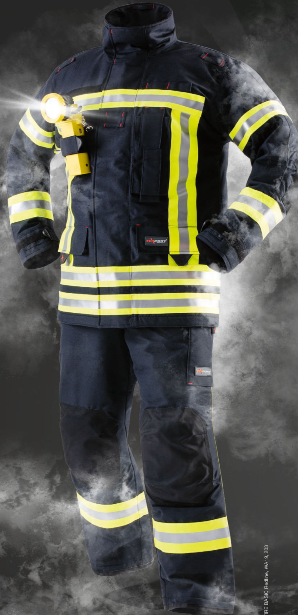
Fig. FIRE BASIC Redline, WA19, 203