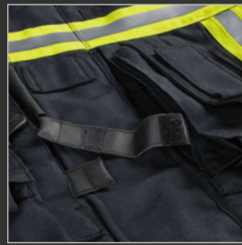
Loop-system tab Pocket opener and carabiner take out