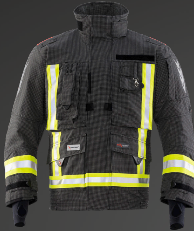
Fig. FIRE STRETCH jacket, YA14, 203

The varied belt systems stand out through heat protection, comfort and simple handling. Thanks to the extensive range of accessories, there is also the possibility to put together systems individually and in doing so to meet the most varied requirements of a fire department. Another advantage is that the harness / rescue strap can very easily be threaded in and out through the well-thoughtout design. Therefore, standard inspection, maintenance and correct cleaning of the jacket are made easier.