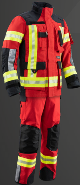
Nomex® NXT red / dark blue 539