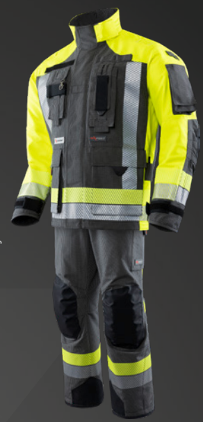
IB-TEX® dark blue / HiVis yellow 523