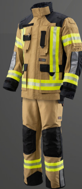
Nomex® NXT gold / dark blue 535