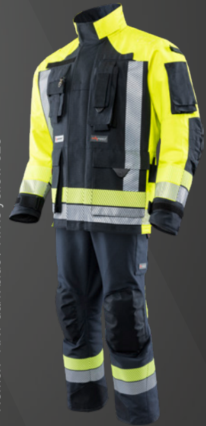
Nomex® NXT dark blue / HiVis yellow 523