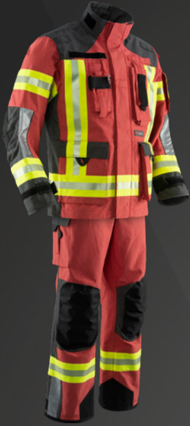
IB-TEX® red / dark blue 539