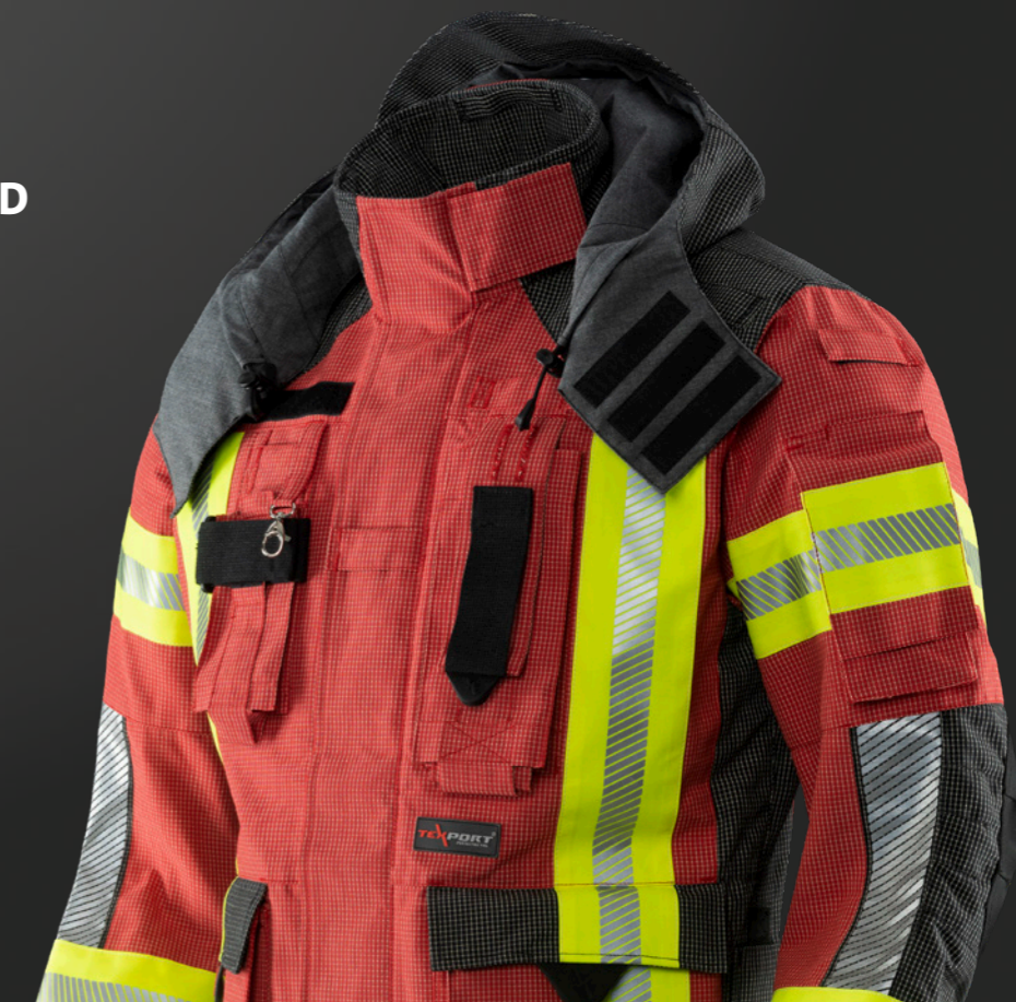
Fig. Guardian RSQ jacket, PA06, 539 with hood, PA06, 203