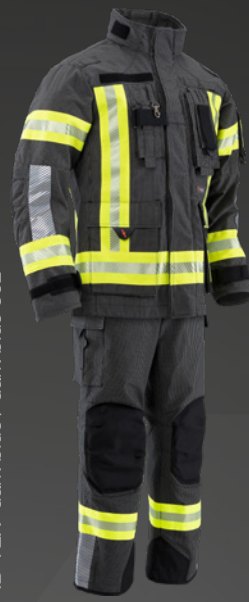
IB-TEX® dark blue / dark blue 502