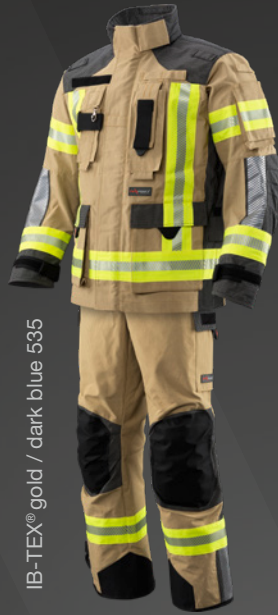
IB-TEX® gold / dark blue 535