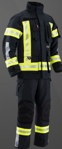
Nomex® NXT dark blue / dark blue 502