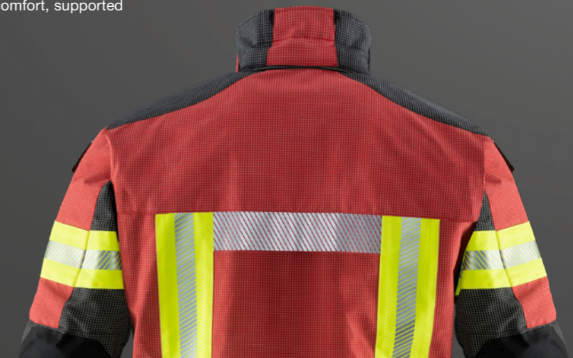
Fig. Guardian RSQ, PA06, 539